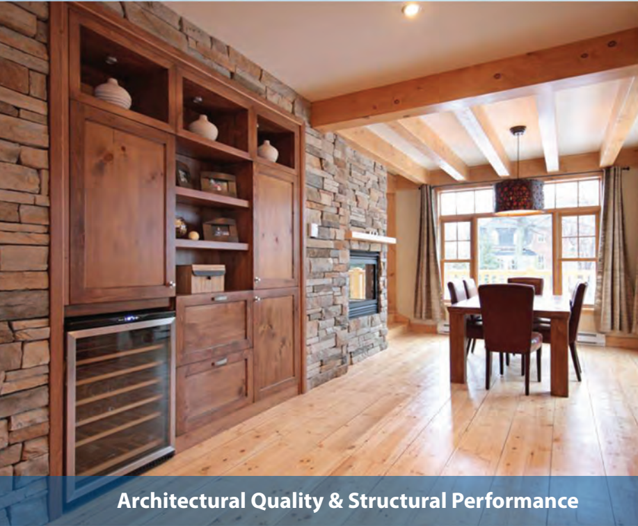
Architectural Quality & Structural Performance