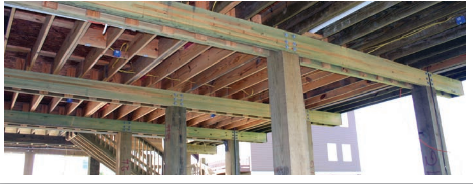
Raised Beach Home

After thorough drying and stain blocking primer has been applied, PPG Beams are stainable and paintable (Columns are not).