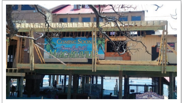
Margaritaville in Destin, Florida