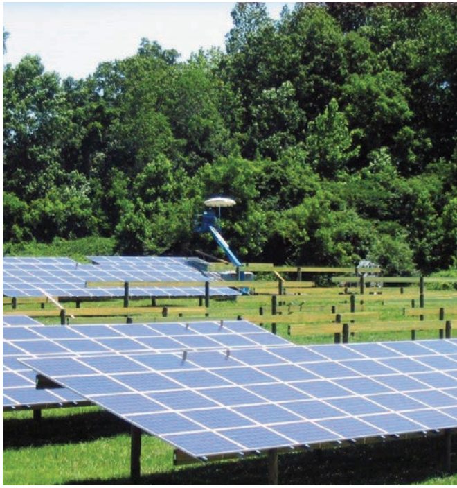
Power Preserved Glulam® solar panel array