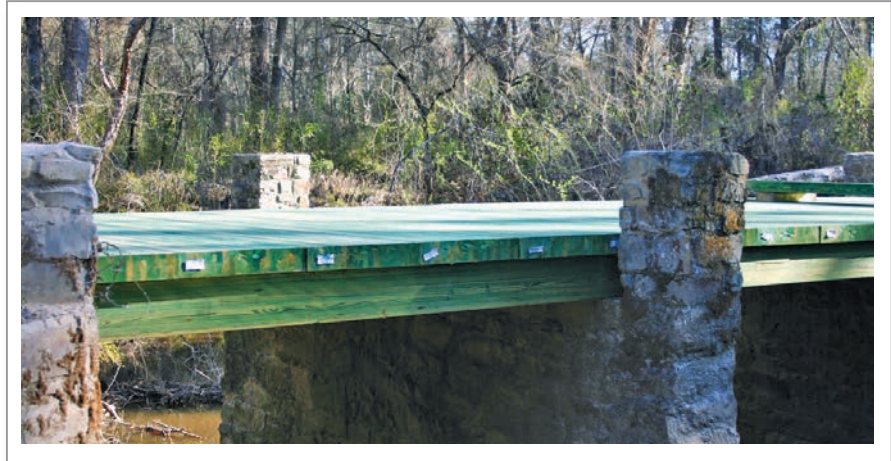
CCC Bridge Davy Crockett National Forest in Lufkin, Texas