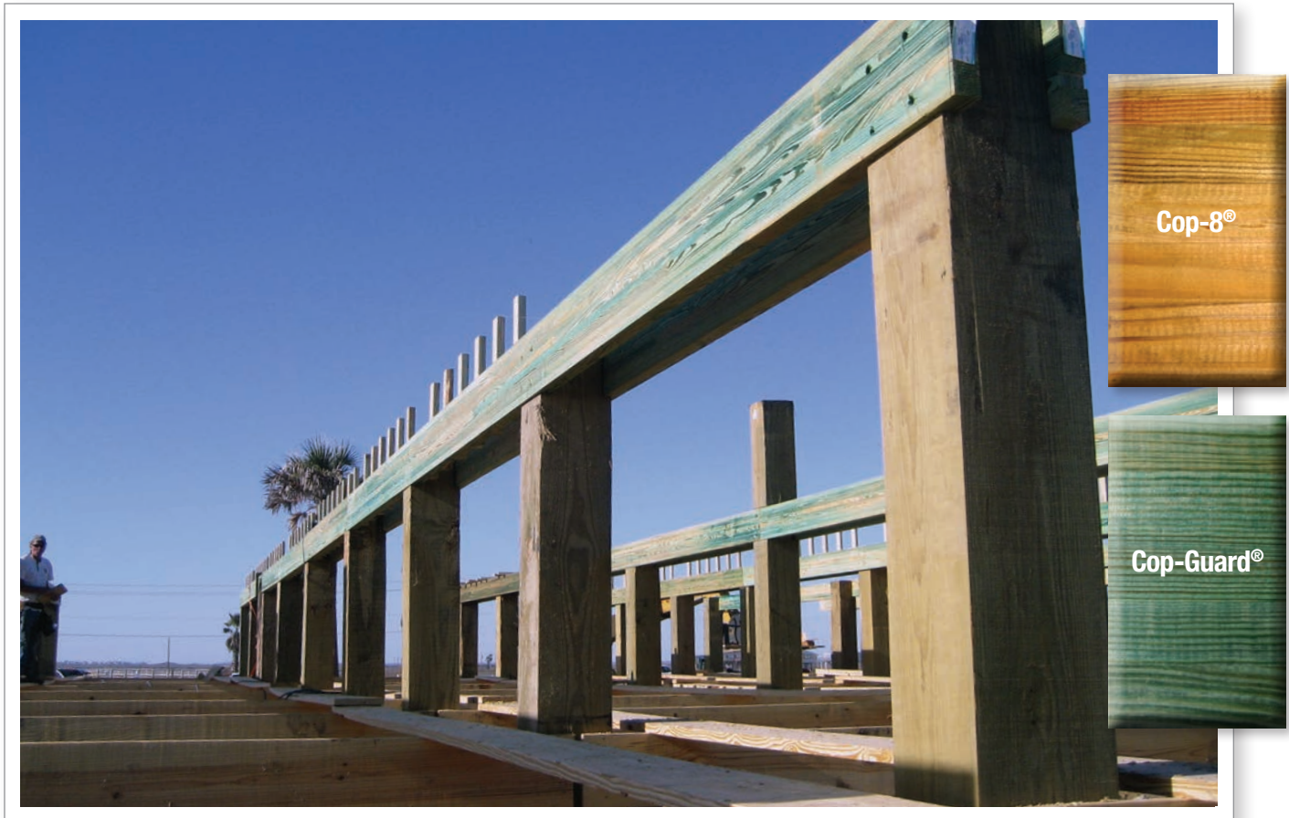
Surfside Beach Community Center