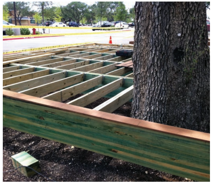
Austin, Texas Deck

If you need technical assistance, a skilled member of the Anthony EWP Team can be reached at 800.221.2326 , 870-862-3414 or at info@anthonyforest.com . www.anthonyforest.com