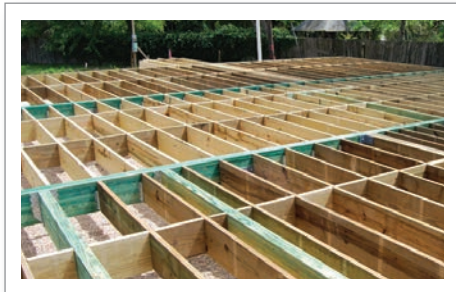
Raised Floor Construction