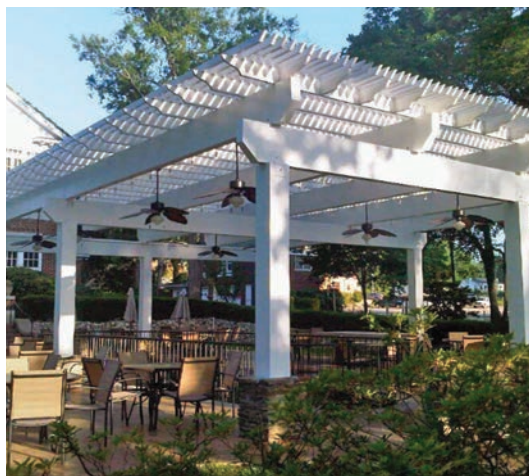
Mason Pergola. Power Preserved Glulam® Beams and Columns