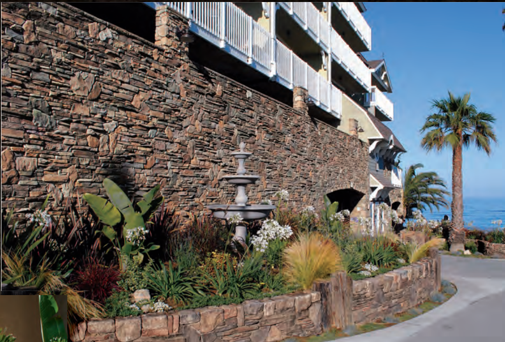
Eastern Mountain Ledge® & Minnesota Fieldstone - Coastal Brown