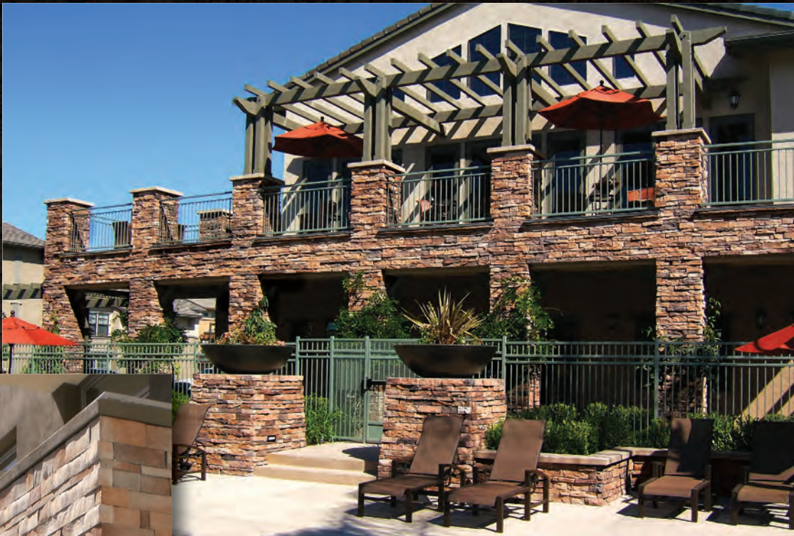
Idaho Drystack - Carmel Mountain