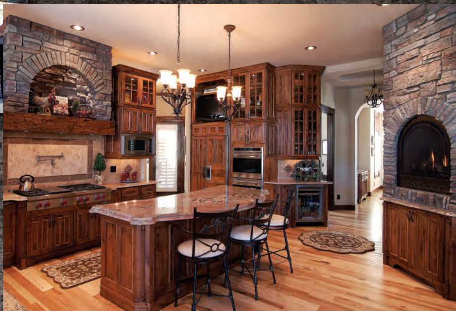
Weathered Edge - Coal Canyon