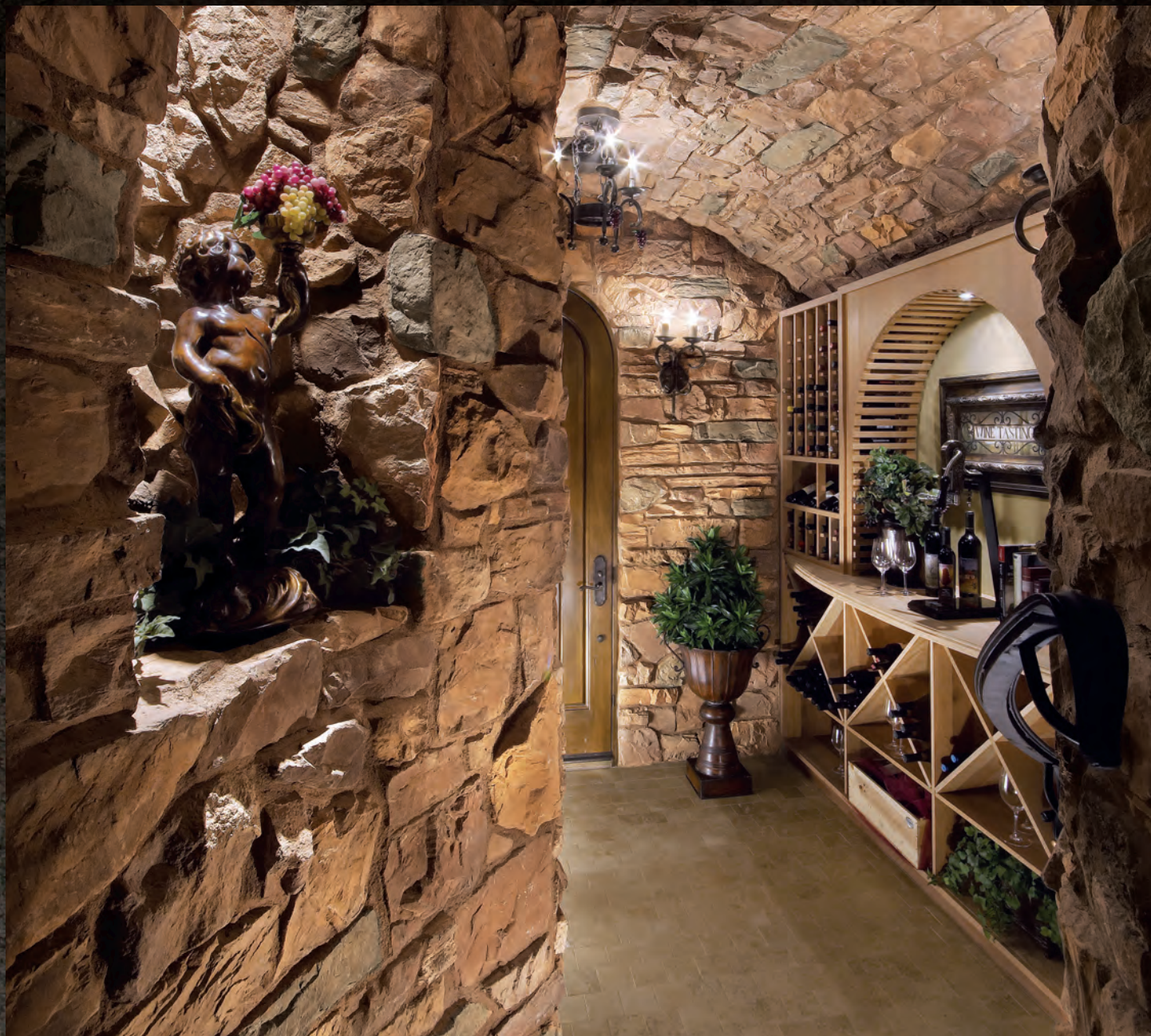
Italian Villa® - Chablis with Mortar Wash

With over 50 years of manufacturing excellence, Coronado Stone remains the most innovative and realistic manufacturer of stone products in the world. Coronado's famous time-saving panelized stones make installation of any project a breeze. Coronado Stone's continued investment in the development of unique products and colors allow architects and designers the freedom to create beautiful, distinctive projects. With manufacturing facilities conveniently located across the U.S., and the widest range of products and colors in the industry, Coronado is clearly "The Leader in Manufactured Stone, Brick and Tile." Give Coronado the opportunity to make you a believer.