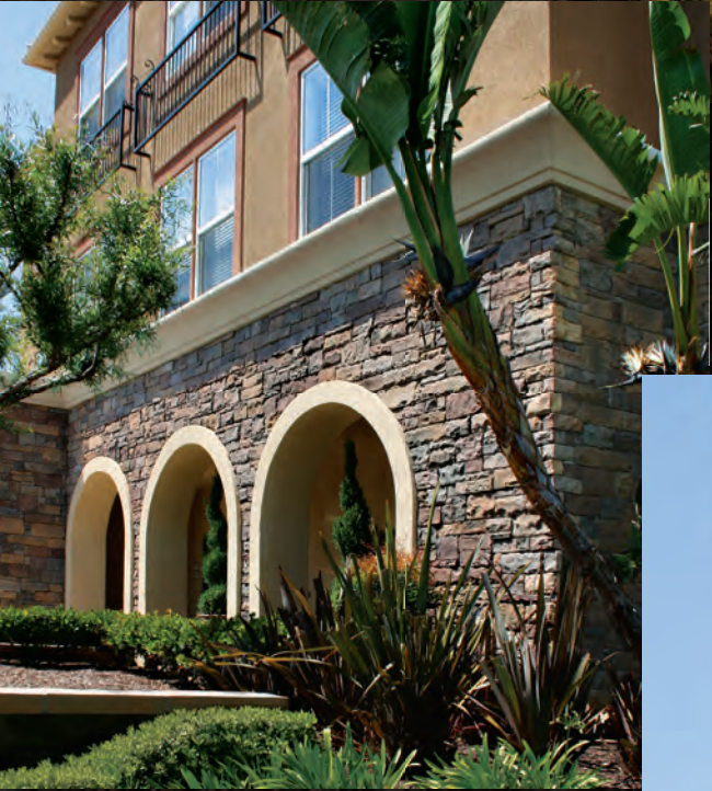
Country Rubble - Aspen