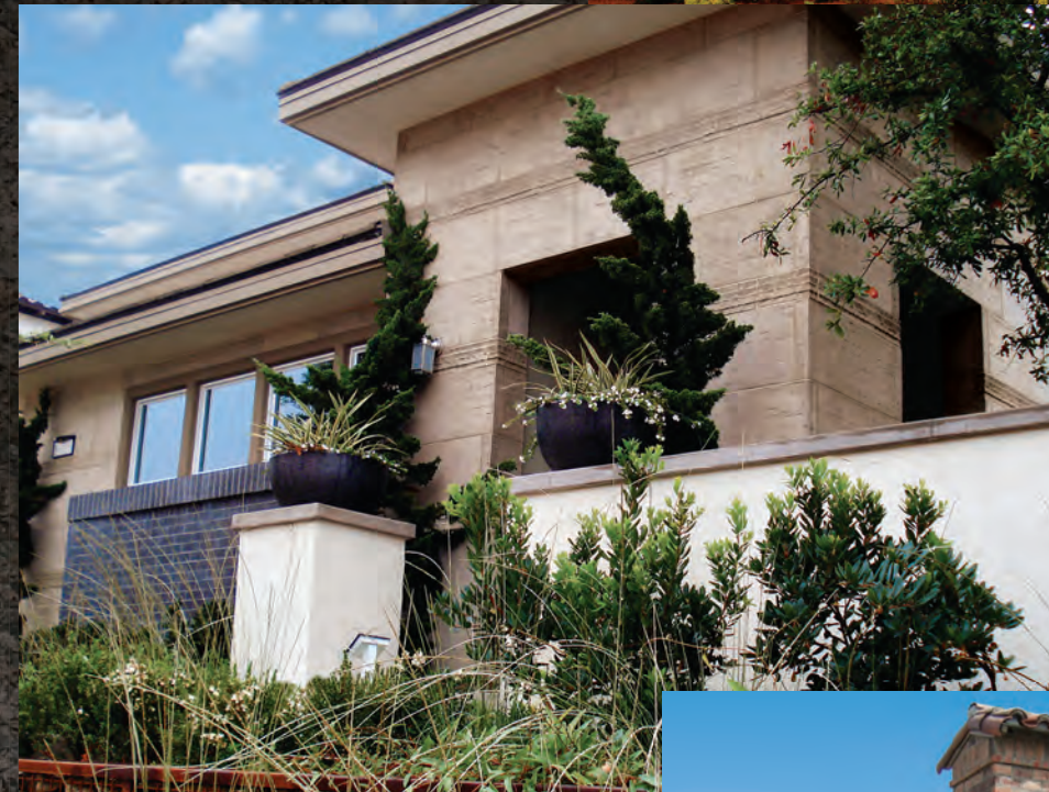
Colosseum Travertine - Roman