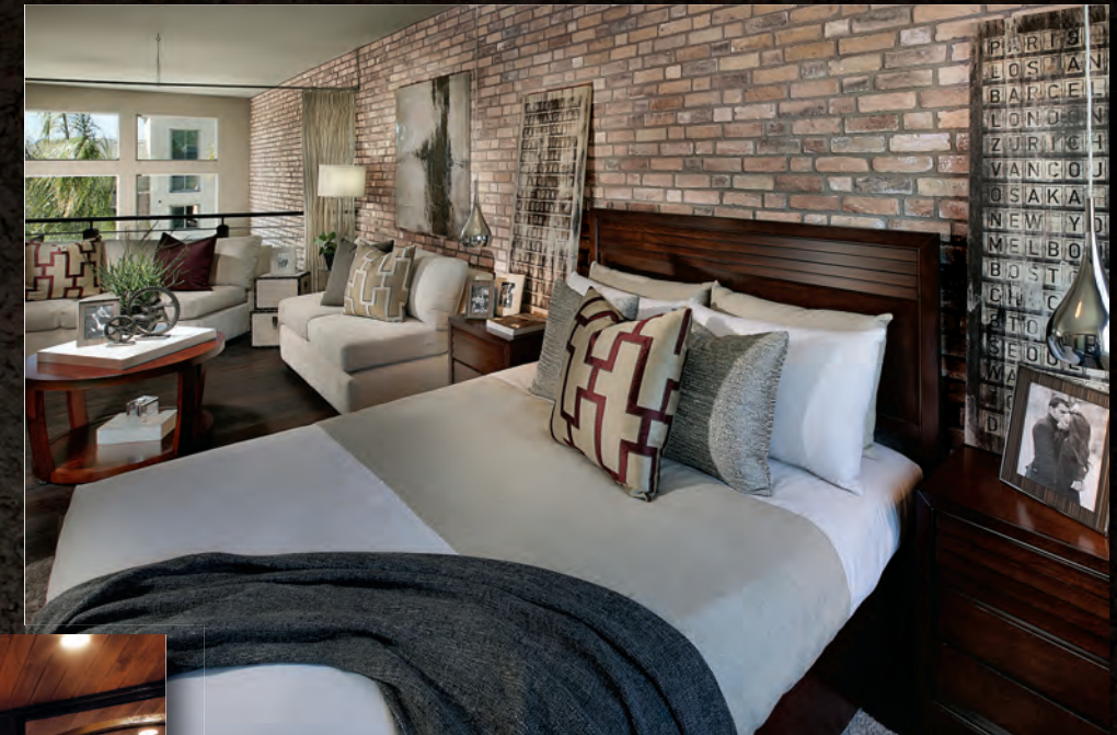
Special Used Brick - Eagle Buff