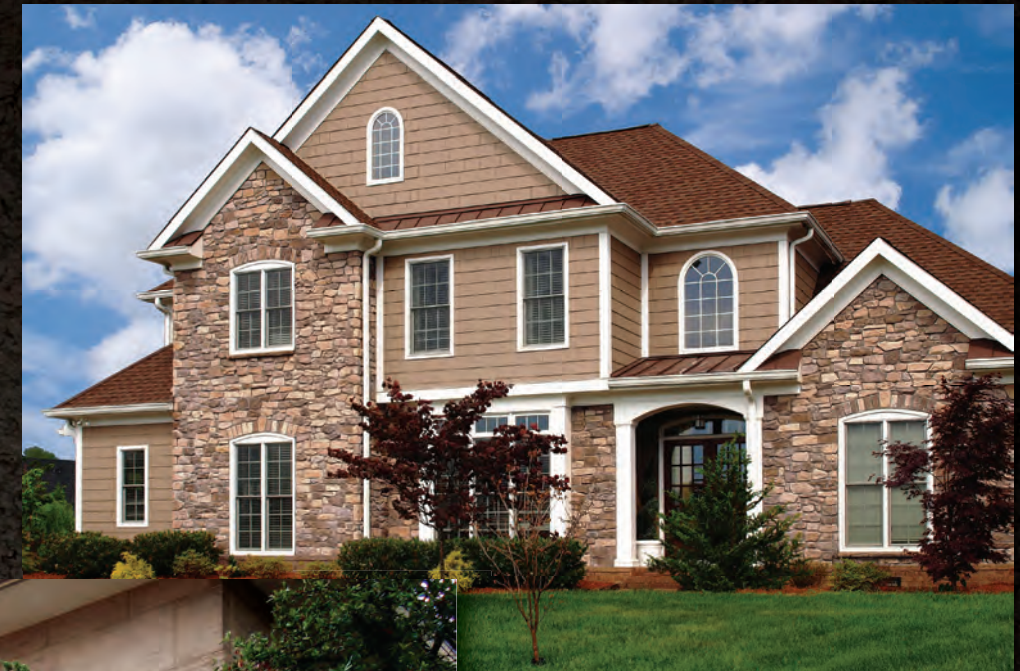
French Country Villa® - Volterra