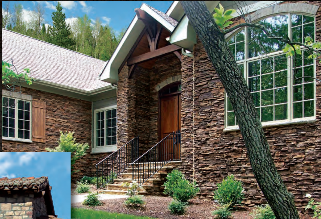
Eastern Mountain Ledge® - Dakota Brown