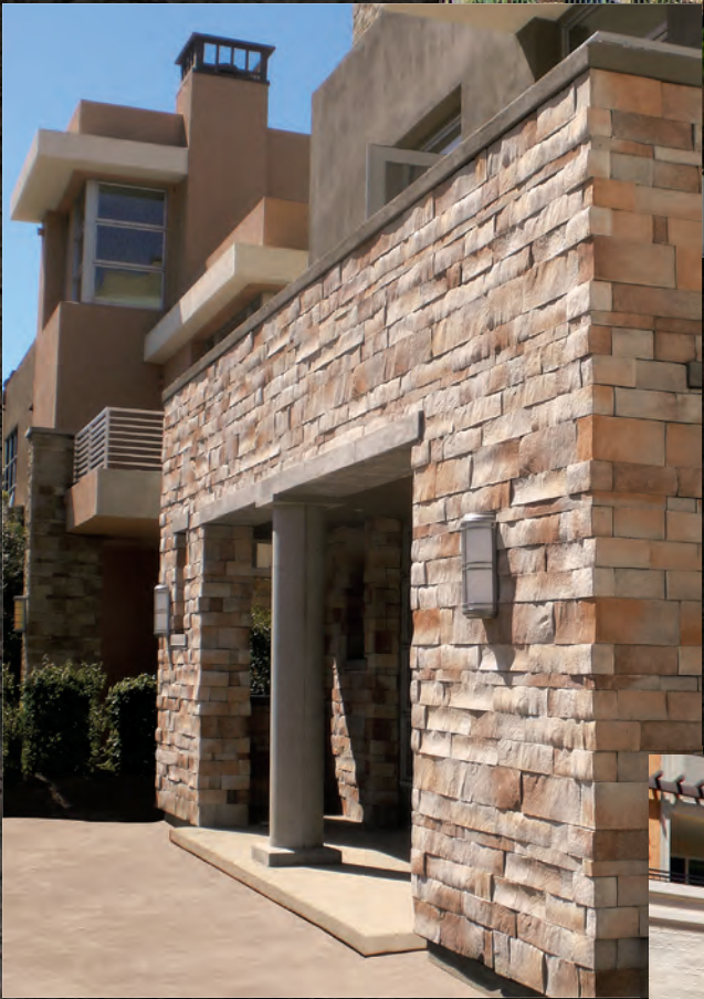
Playa Vista Limestone - Alaskan Sunset

12" x 24" Chiseled Limestone - Cream 12" x 24" French Limestone - French White 16" x 24" Colosseum Travertine - Harvard Grey