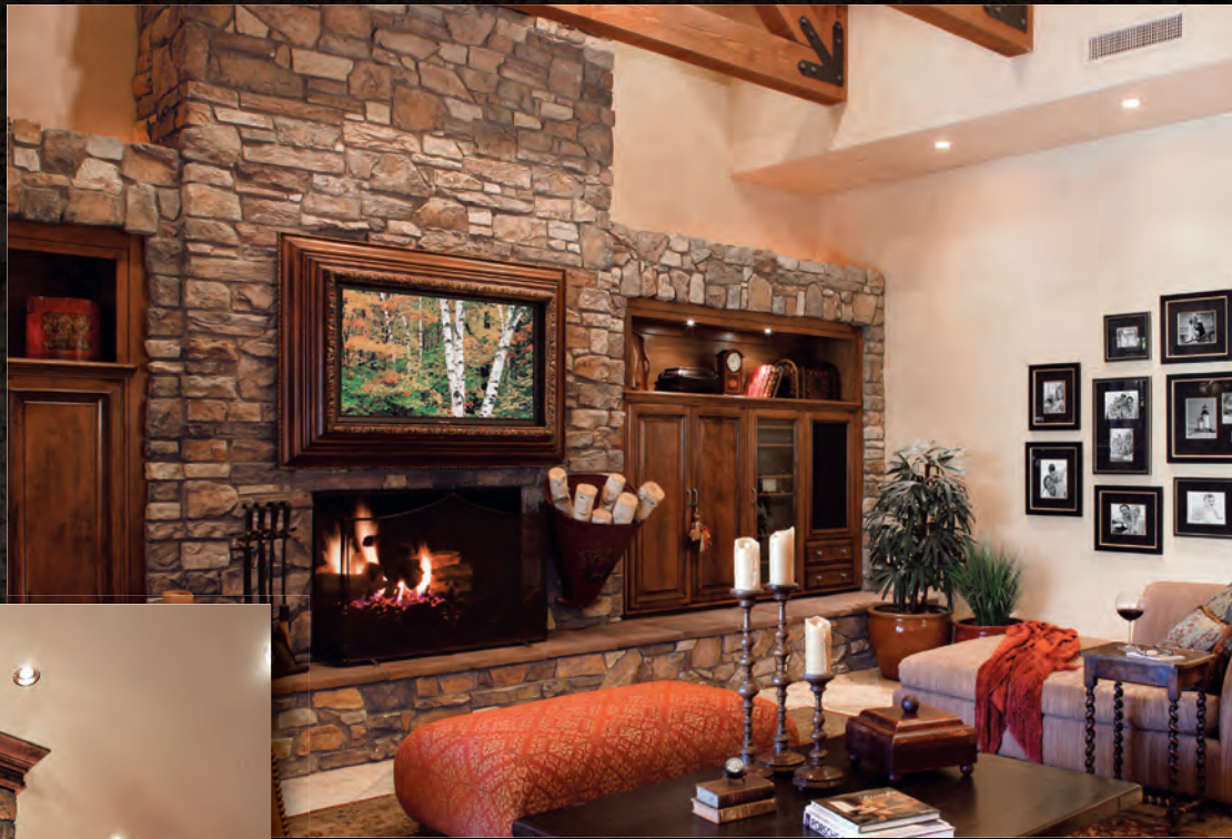
Italian Villa® - Volterra