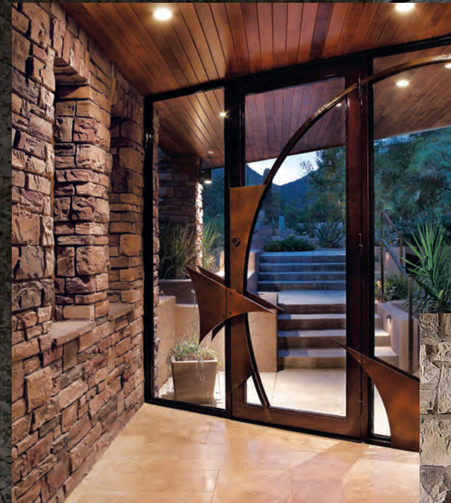
Old Country Ledge - Carmel Mountain