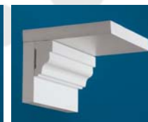
Dressing up cornice moulding can be as easy as detailing trimboards with rake.