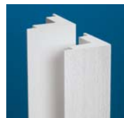
J-POCKET ONE-PIECE CORNERS FOR SIDING SMOOTH WOODGRAIN