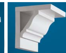
The use of crown moulding elevates any exterior trim application, creating a more formal look.