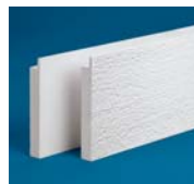
J-POCKET TRIMBOARDS FOR SIDING SMOOTH WOODGRAIN