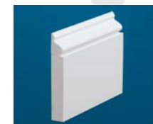
This trimboard accented with base cap shows no matter how simple the project, you can add detail and interest.

There's no limit to how Restoration Millwork profiles can be combined for unique looks.