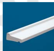
197 DRIP CAP