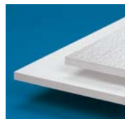
SHEETS SMOOTH / SMOOTH WOODGRAIN / SMOOTH