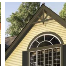
Choose a bolder accent to create striking contrasts.