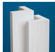
ONE-PIECE CORNERS SMOOTH WOODGRAIN