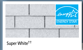
Super White ††