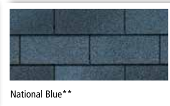
National Blue **