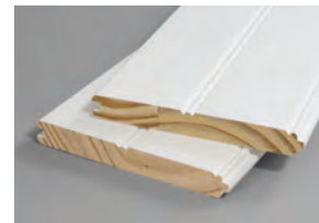
Edge & CB