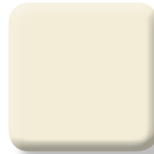
16 - Almond