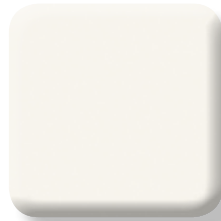
11 - White