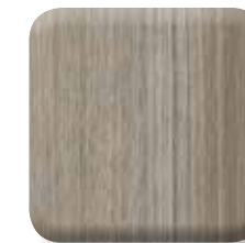
705 - Tuscan Teak Grigio