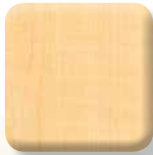
55 - Hard Rock Maple