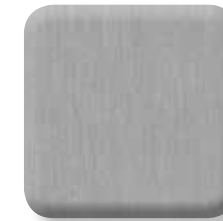
514 - Silver Frost ■