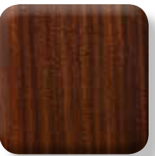
754 - Auburn Mahogany

Colors and patterns shown are printed reproductions and may differ slightly from the actual product. Roseburg recommends viewing actual samples.