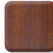
318 - June Mahogany