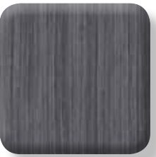
750 - Evening Linea