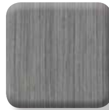
751 - Twilight Linea