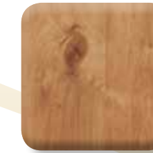
700 - Rustic Alder ■