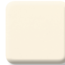
109 - Antique White