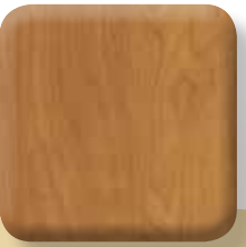
51 - Wild Cherry