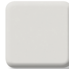
108 - Folkstone