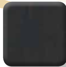
663 - Chocolate Apple