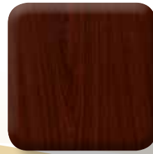
54 - African Mahogany