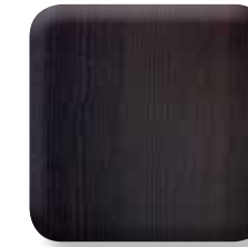
391 - Corboda Pine