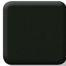
06 - Black