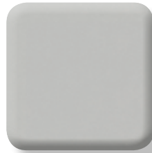
22 - London Grey