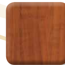
665 - Wild Apple