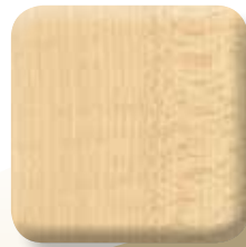
04 - Natural Maple ■