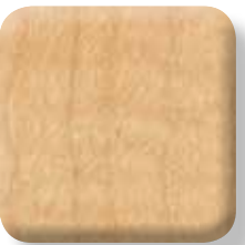
477 - Fusion Maple ●