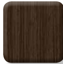
752 - Tierra Linea