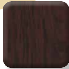
404 - Mahogany Impressions ●