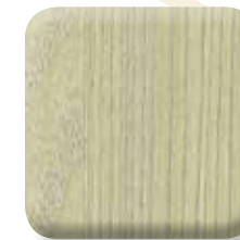
834 - Calm Horizon