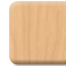
352 - Cabinet Maple