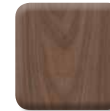
701 - American Black Walnut ■