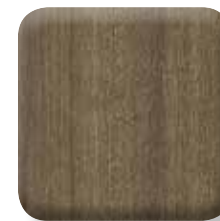
832 - Southern Cattails