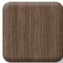
753 - Acorn Linea