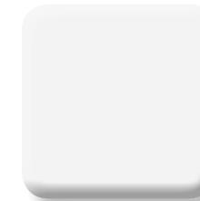
120 - Glacier White ●