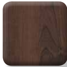
706 - Chocolate Cherry