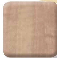
661 - Caramel Apple