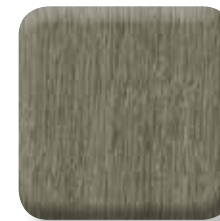
833 - Ruby Beach