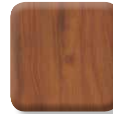
78 - Windsor Mahogany